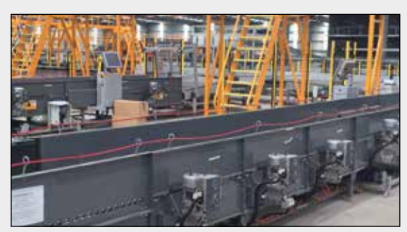
BCS solution for Toll IPEC facility Melbourne

Our business breaks into three business units being Airport Systems, Operations and Maintenance and our newest business unit Services and Solutions (SaS).