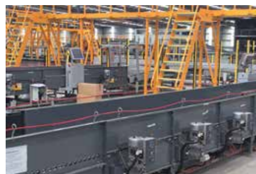
BCS solution for Toll IPEC facility Melbourne

The Electronic Drive: NORD's motor starters and frequency inverters, which are developed and manufactured at the company's own electronics plant, are very compact, enable easy commissioning, and feature consistent operability. The varied range of types and options provides a scalable feature set for precise adaptation to your requirements.