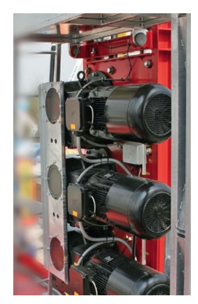
Strong and safe. – Electronically controlled geared motors gently move loads of several tons.

Application-specificengineering.—Instead of standard gears, STROS is supplied with customized units assembled exactly as requested. Depending on the project, some of these gears are e.g. fitted with reinforced bearings, or use special gear case materials, or are ATEX and NEC-compliant. Cabinet-mounted inverters are available in different performance classes and with scalable functionality. In addition to features like emergency evacuations, optional functions include e.g. positioning and safety features like STO and SS1 for safety requirements up to SIL 3.