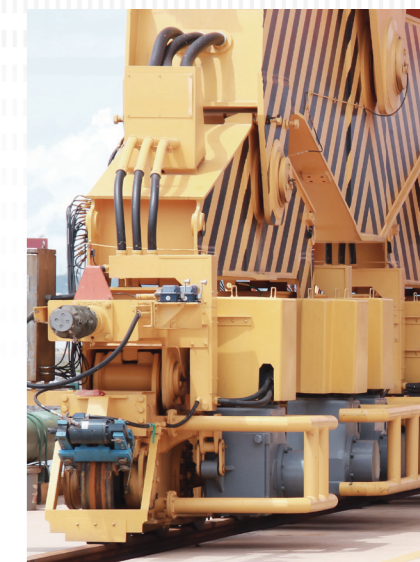
Record holders Wugang port has the largest loading systems in civil use throughout China.

weather. Well sealed against moisture ingress and fitted with corrosion- and moisture-resistant components, they provide a high degree of protection against the typical challenges of maritime environments. Special paint coats are applied against the salty atmosphere. Since all gear units feature a single-cast housing, they are extremely durable and wear-resistant, even though the loading and unloading systems carry massive loads most of the time. Most drive units come equipped with application-specific optional parts, including e.g. dust- and corrosion-protected brakes, micro-switches for continuous brake monitoring, or double canopies serving as drip covers at the motor fans. Such features further enhance the reliability of these geared motors and help ensure they achieve an extra-long lifespan.