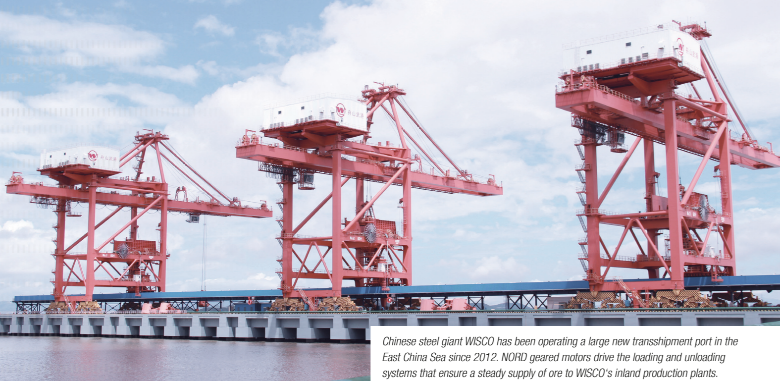
Chinese steel giant WISCO has been operating a large new transshipment port in the East China Sea since 2012. NORD geared motors drive the loading and unloading systems that ensure a steady supply of ore to WISCO's inland production plants.