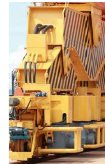
Record holder. The biggest loading facilities for civil use in China are located at the Wugang harbour.

heavy-duty housings for outdoor use and tough climatic conditions. They are effectively protected against the entry of fluids and equipped with corrosion- and moisture-proof components. Special paints are used for protection against the salty atmosphere. In this way, the drive units are optimally protected against the conditions of the location. Thanks to their one-piece UNICASE housing design, these geared motors are particularly resistant to wear in spite of the enormous loads they have to handle permanently. Most units were fitted with application-specific, optional components – including dust-proof and corrosion-protected brakes, micro switches for continuous brake monitoring, and doubled protective covers for the motor fans. With these features, their very long service life gets even more reliable.