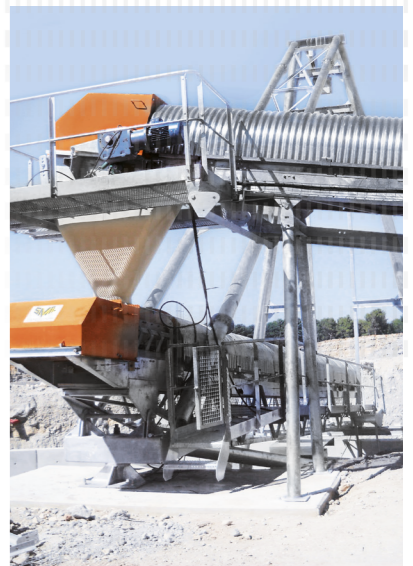
Tough design Robust NORD geared motors are designed to withstand harsh conditions at the quarry.

Pre-assembly was carried out in SMIL's workshop to fit the geared motors to the conveyor heads. Universal motors with IEC fittings are used to allow for quick and easy replacements if a motor does break down. Comprehensive cooperation. – In the early engineering stage, SMIL also drew on support from NORD teams who assisted in the specification of the most suitable equipment for the target application. While work on the complex Gardanne project was underway, NORD drive systems were also selected for several other conveyor belts installed at another plant operated by Durance Granulats.