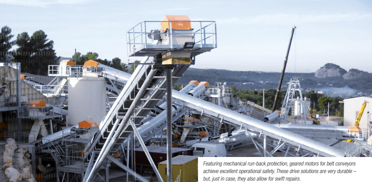
Featuring mechanical run-back protection, geared motors for belt conveyors achieve excellent operational safety. These drive solutions are very durable – but, just in case, they also allow for swift repairs.